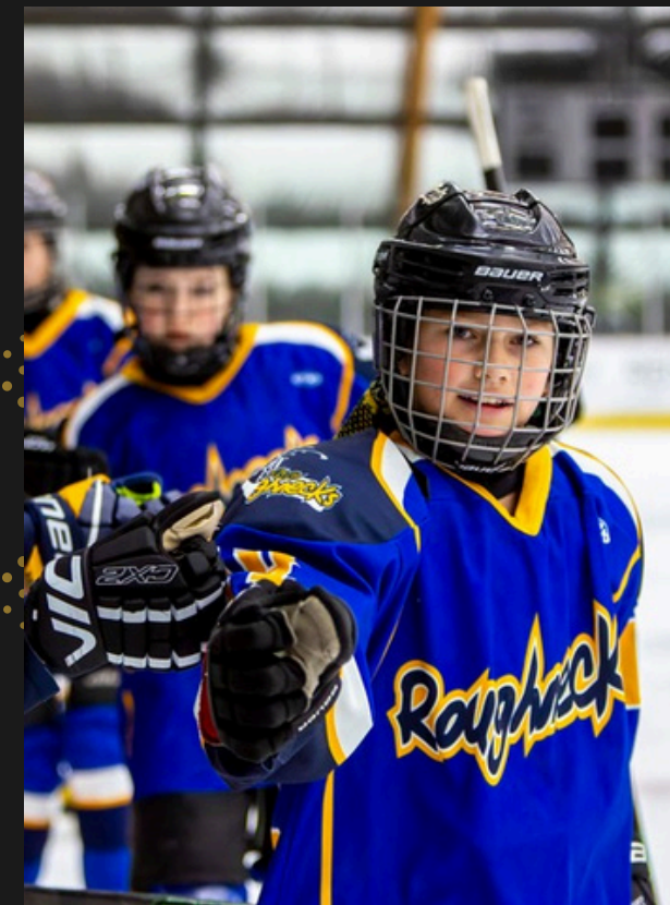
ACCOUNTABILITY AND RESPECT