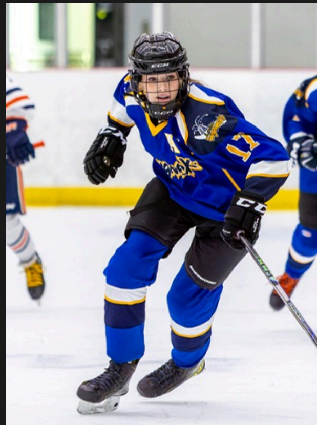
ATHLETE CENTERED DEVELOPMENT