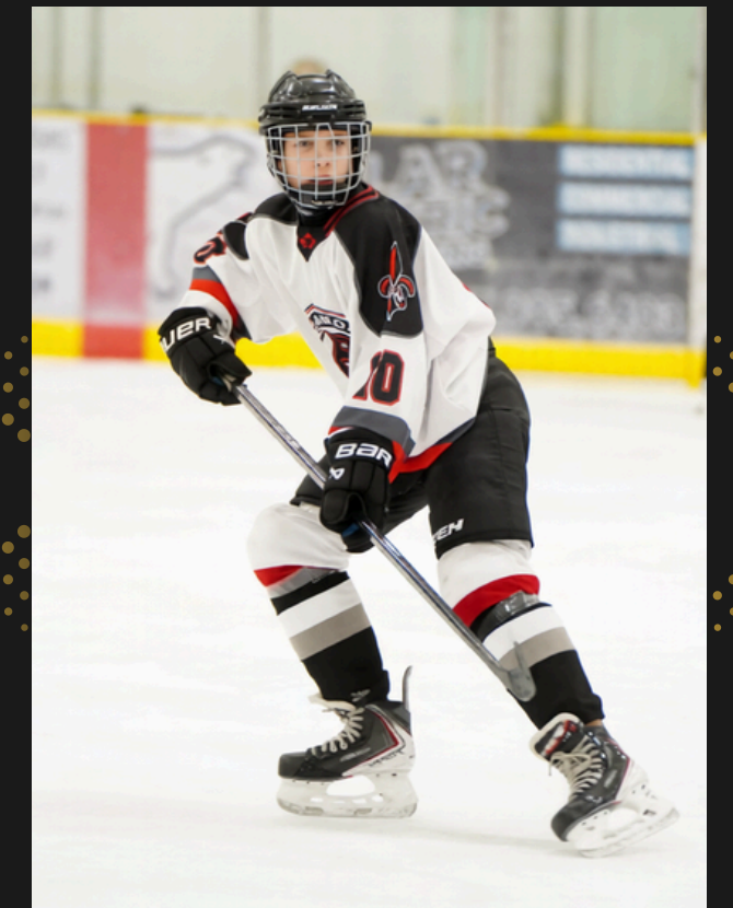
SAFETY & INTEGRITY