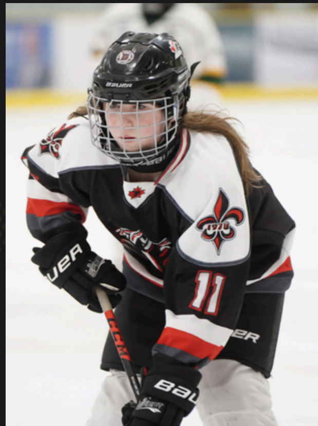
INCLUSION & BELONGING